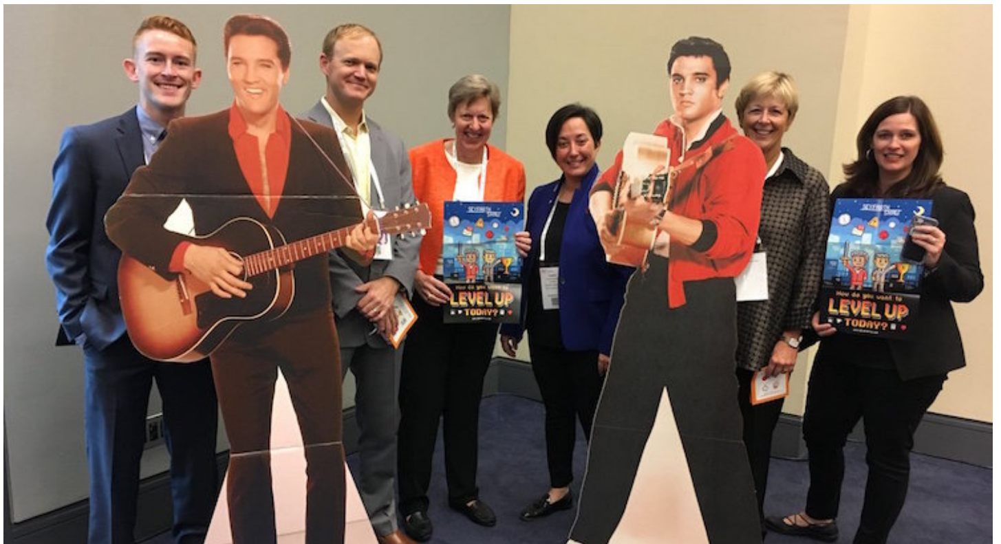
“Celebrity” sightings at the ACC 2017 Annual Meeting.

Did you know Elvis was on tour last fall? It’s true — there are photos to prove it. Right before ACC’s Annual Meeting, he visited Knoxville, San Francisco, Boston’s Fenway Park, Chicago’s Wrigley Field, Seaworld in Southern California, and a smaller, intimate engagement at the Fox Theater in