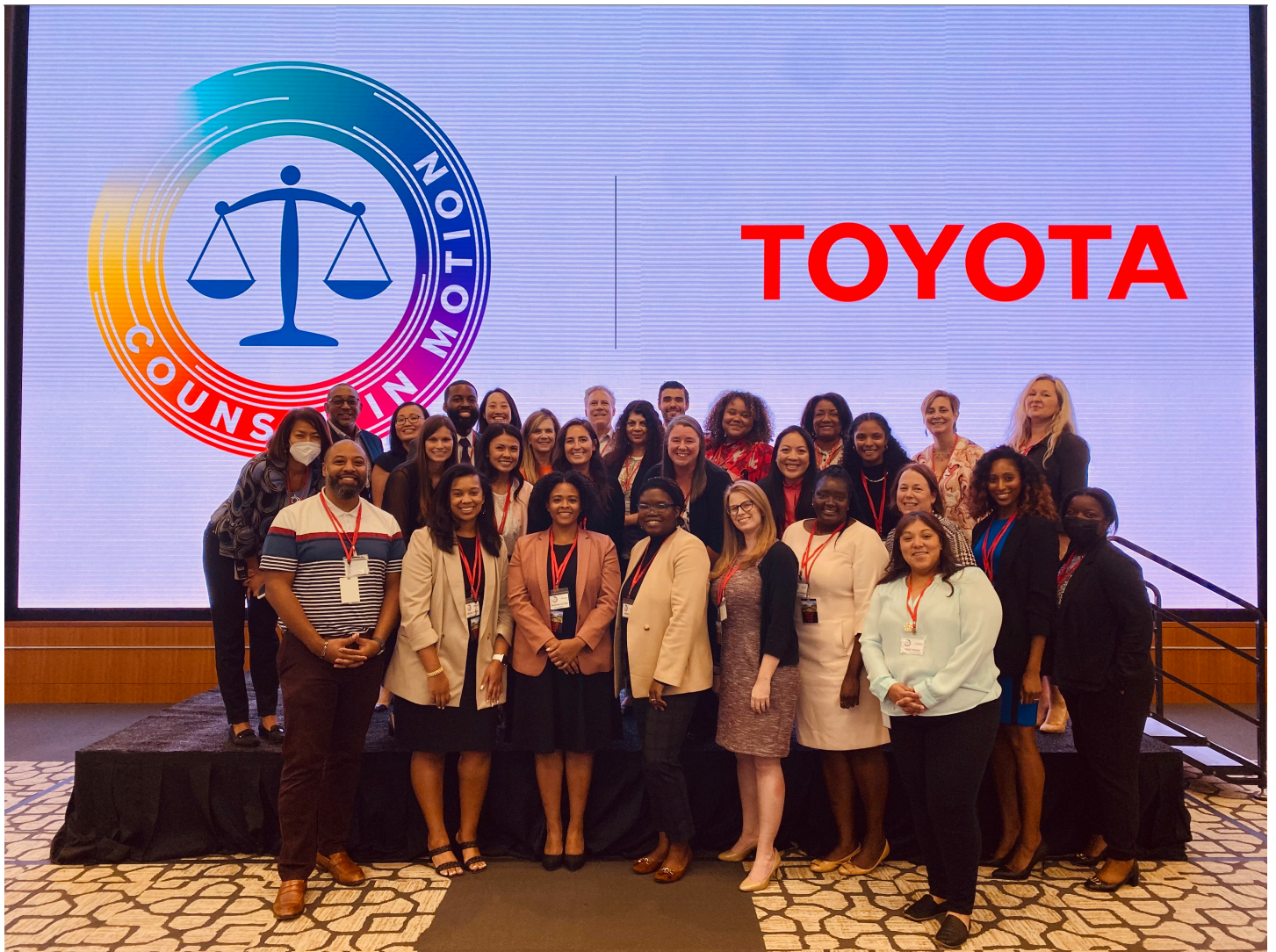
The 2022 Toyota Counsel in Motion cohort gathered in Plano, Texas.