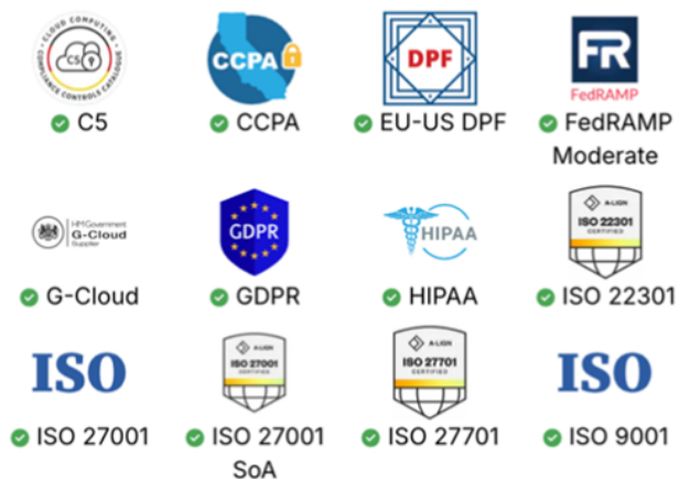
Figure 3. Everbridge Trust Center ( https://trust.everbridge.com )

With a trust portal, the process shrinks from six steps to two — without sacrificing thoroughness: