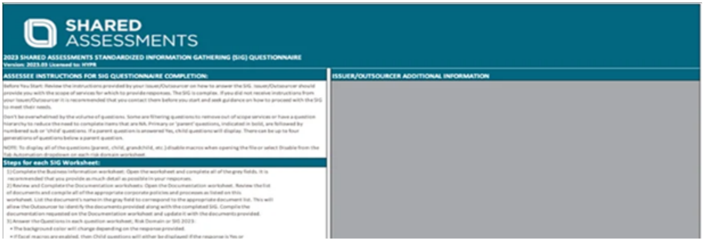
Figure 1. Standardized security questionnaire