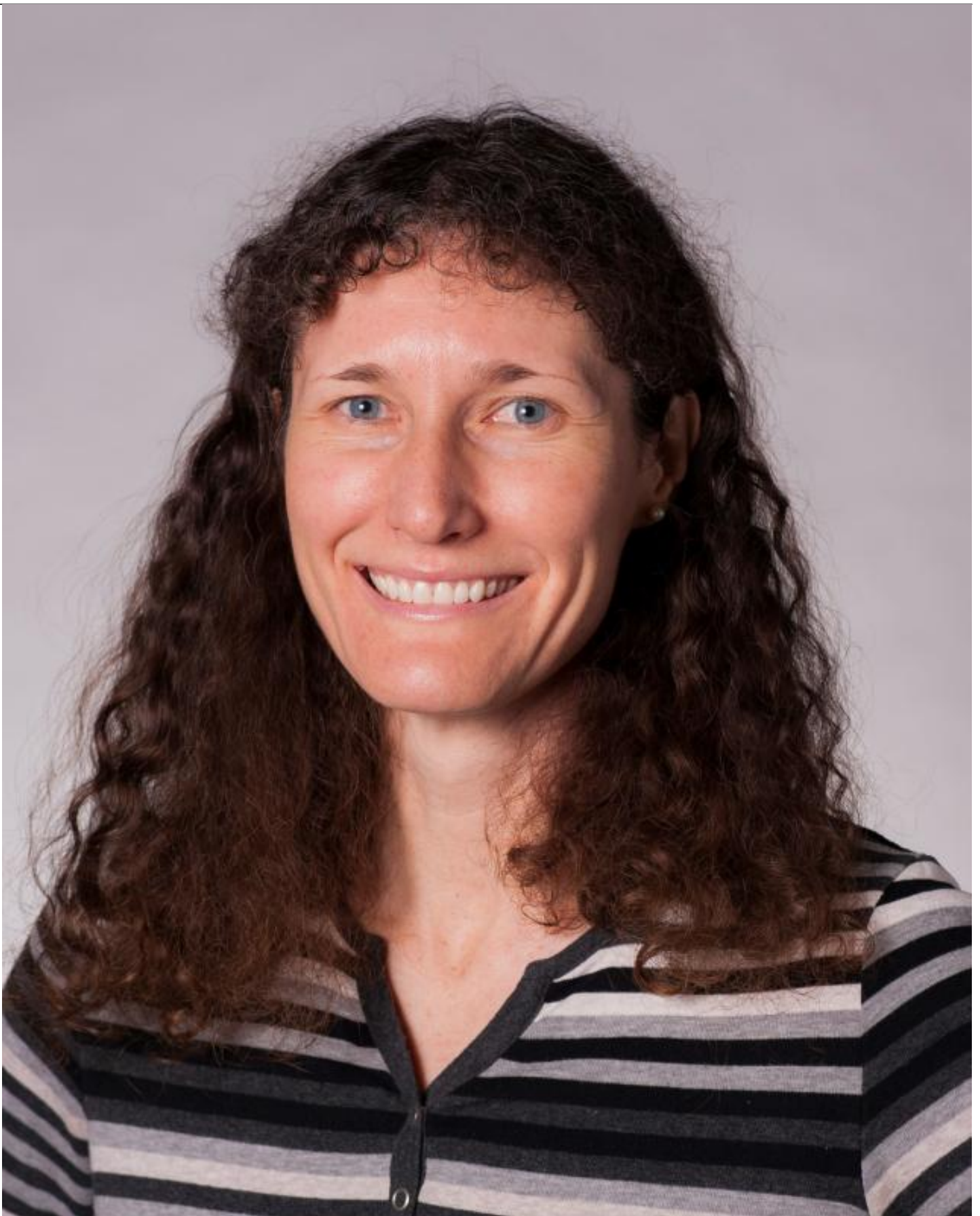
Chief Compliance Officer Epoch Payment Solutions