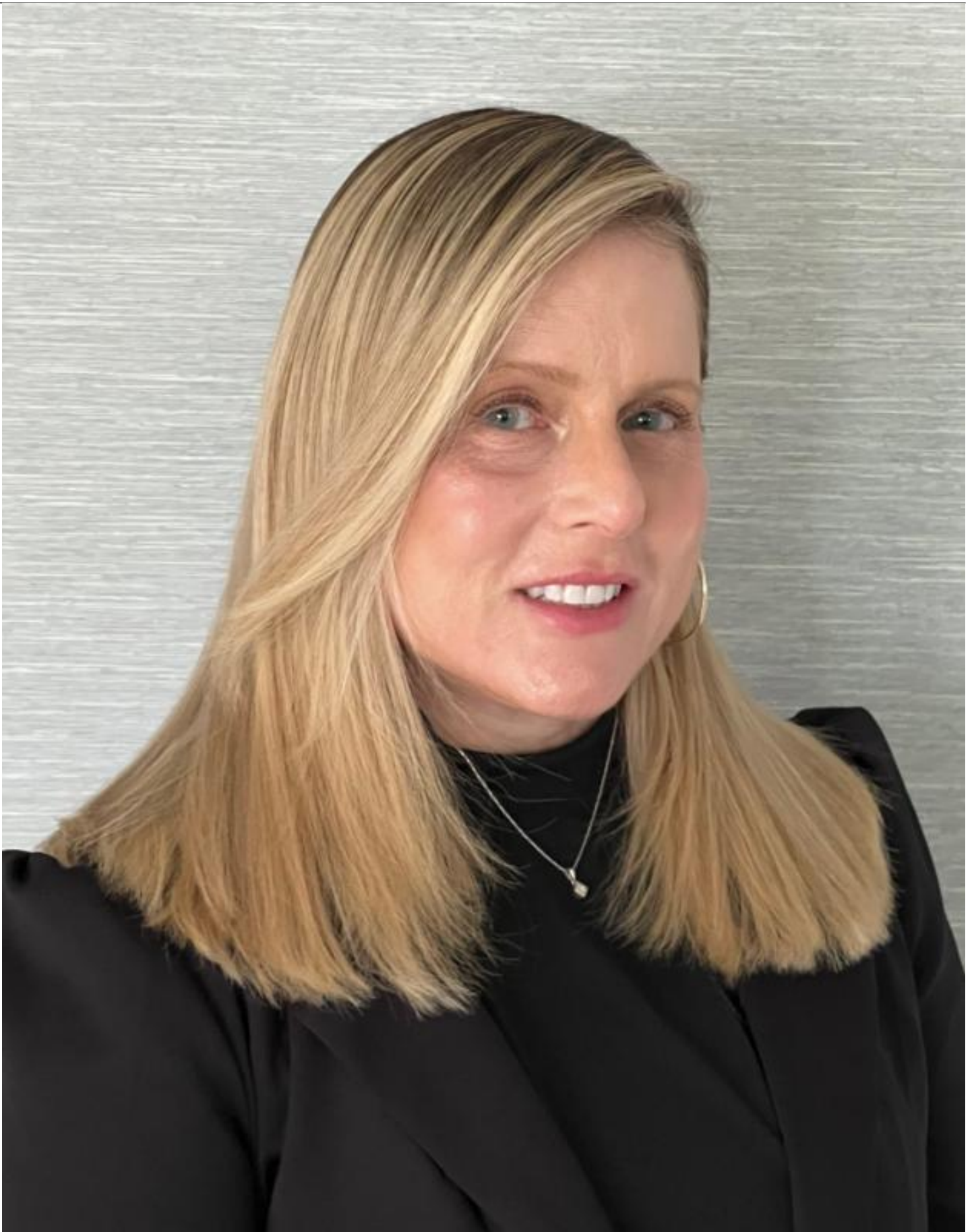
Partner and Group Head of Virtual-Fractional General Counsel Practice Group