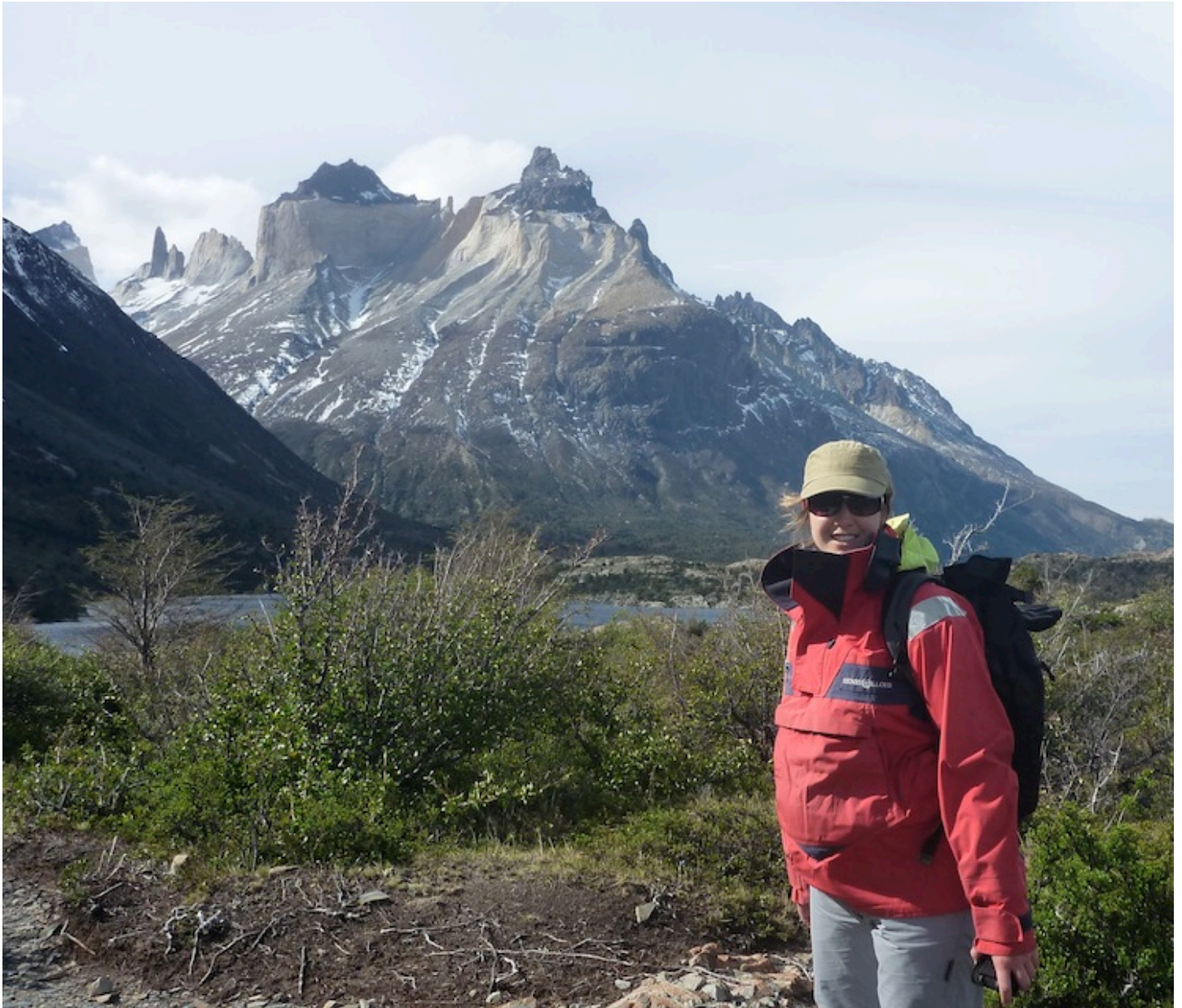
Torres Del Paine National Park in Chile