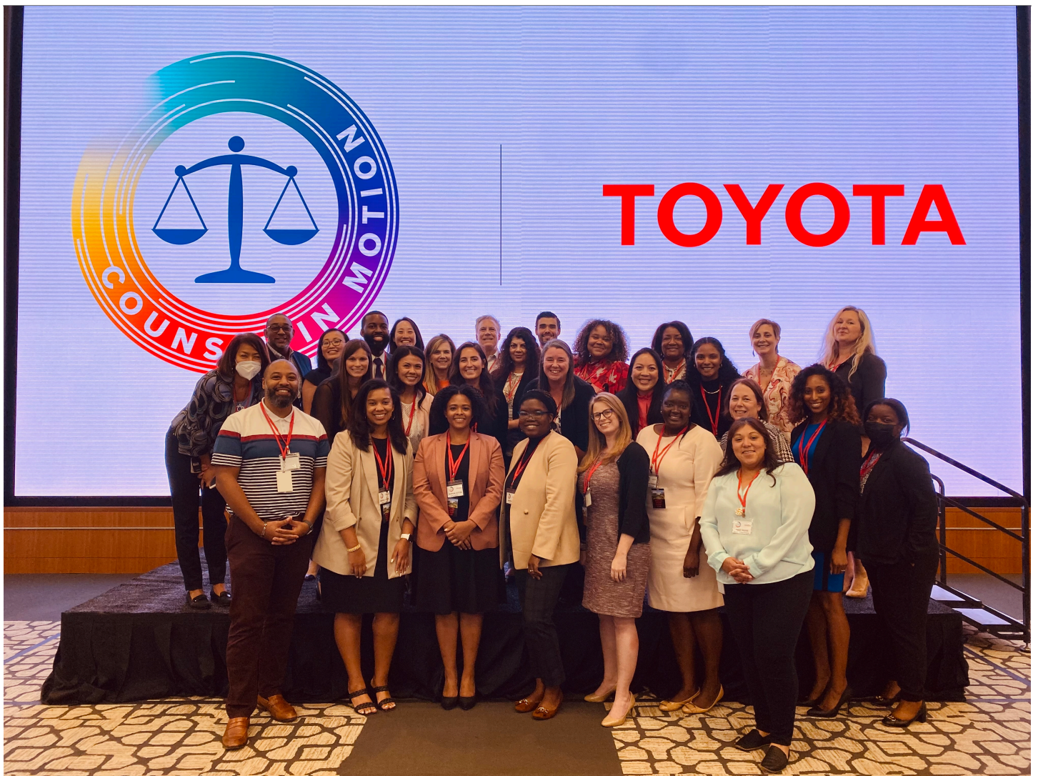
The 2022 Toyota Counsel in Motion cohort gathered in Plano, Texas.