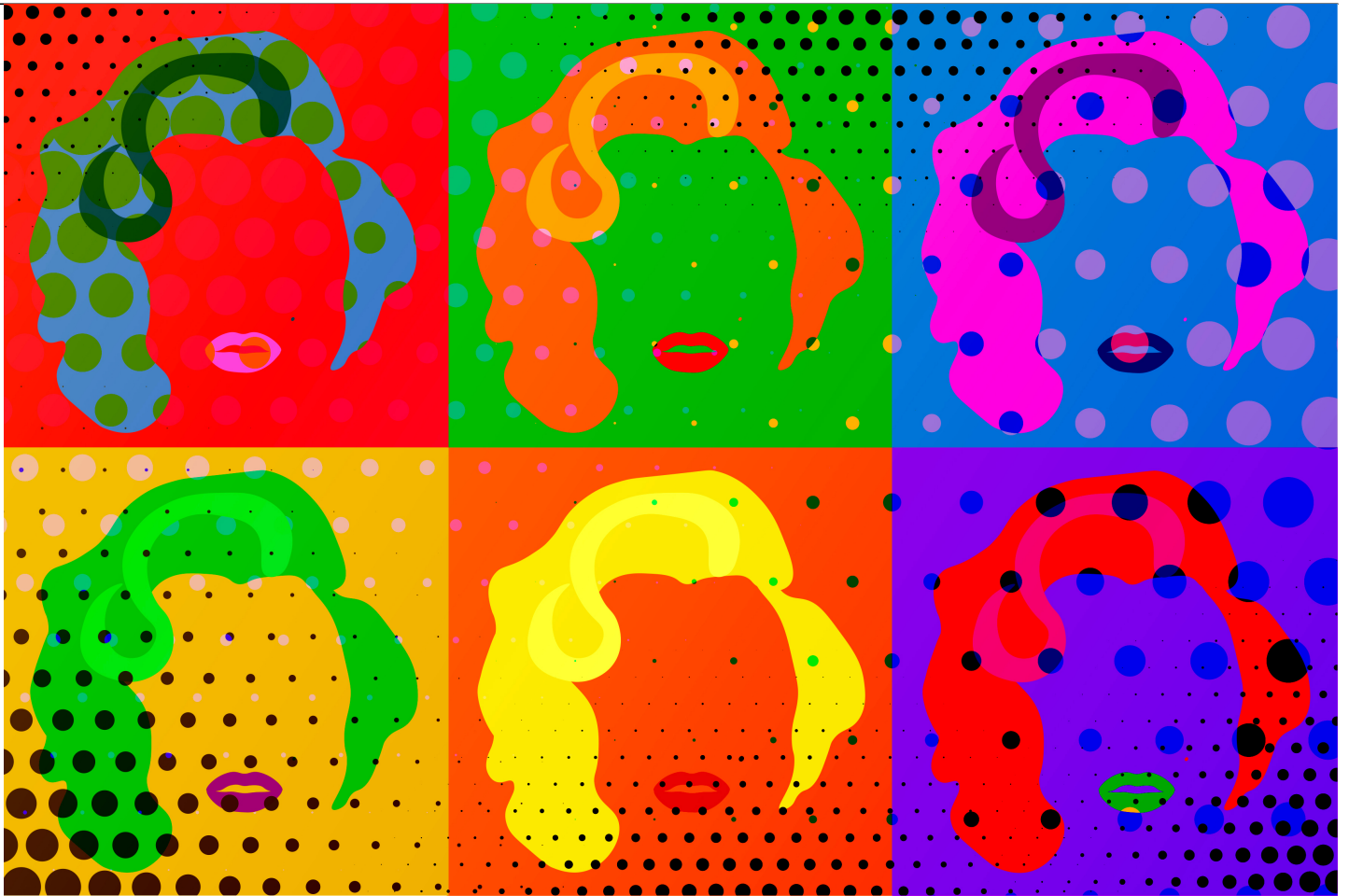
Banner artwork by robin.ph / Shutterstock.com